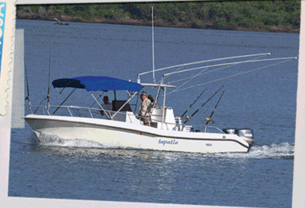
Tapatia is a Mako 28' fishing boat with two Yamaha 200 HP engines