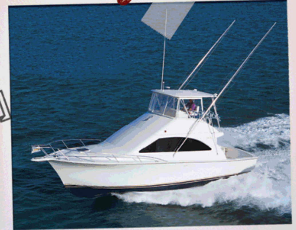
Fortuna is an Ocean Yachts 40' equipped with two 3126 (420 BHP) CAT engines